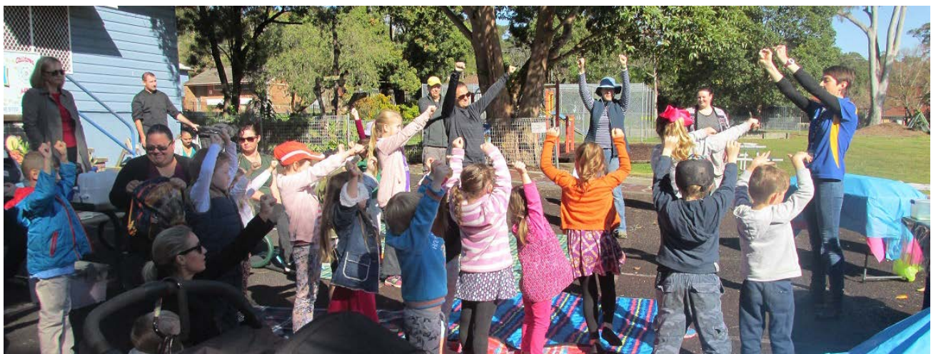
Newcastle University SMART Team at Windale with families connecting!

It aims to provide a structured, education-focused early learning program at home to help prepare children for and participate in school; and is run at the Newcastle suburb of Windale.